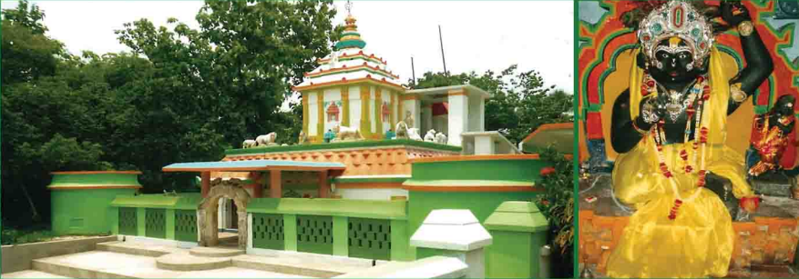
Shree Shree Giridhari dev Temple (1840 A.D), Constructed by King Kishoi Mansingh at Dompada