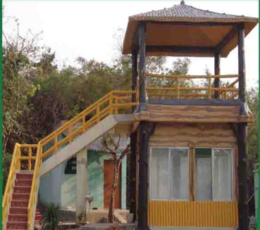
Watch Tower at Deras

The important places in the sanctuary of tourism point of view are: Bharatpur, Kuasara, Godibari, Godibari, Kochilaberena, Ambakhali, Baunsaberena, Bualigarh, Godabhangatarang, Pitagadia, Naharthali, Kumarakhunti, Salabari, Pithakhia, Mantu, Dahanigadia, Nuakua, Dholakatha, Jhumka, Deras, Baunsaghara, Jhalara, Ambilo, and Madua.