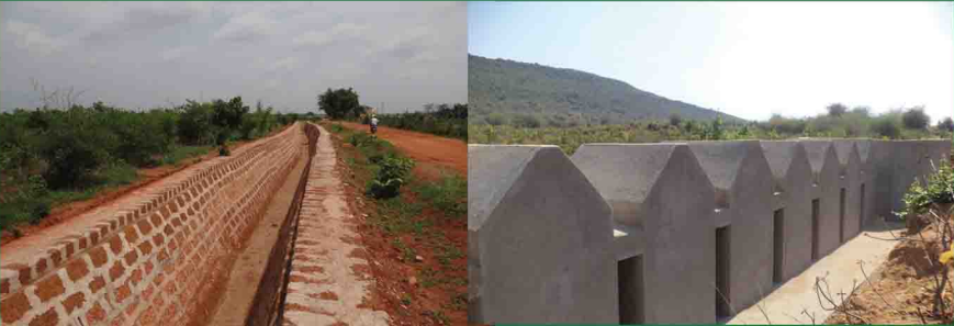
Different Types of Elephant Proof Barriers

Seasonal barrier 149 numbers at 5 mt spacement has been constructed in 2013-14 in Dampara Range